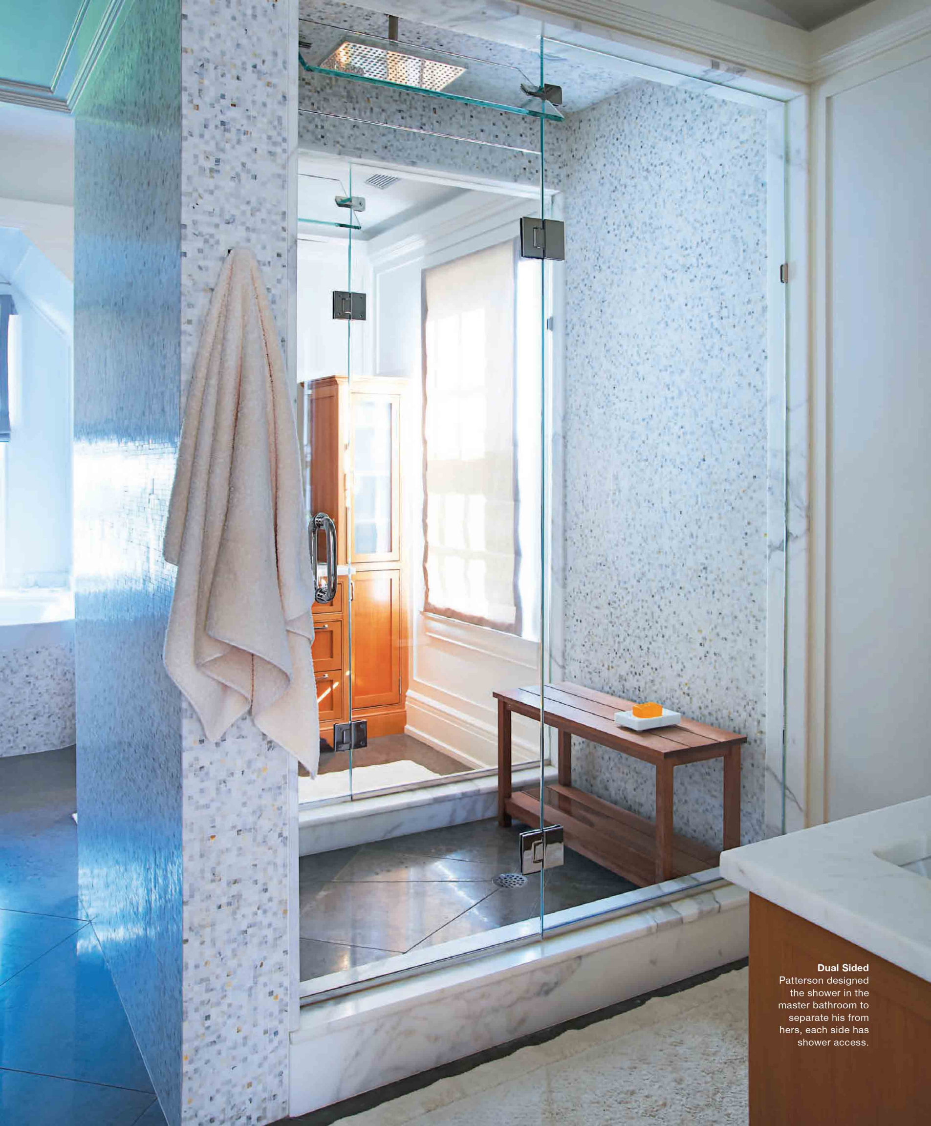
Dual Sided Patterson designed the shower in the master bathroom to separate his from hers, each side has shower access.