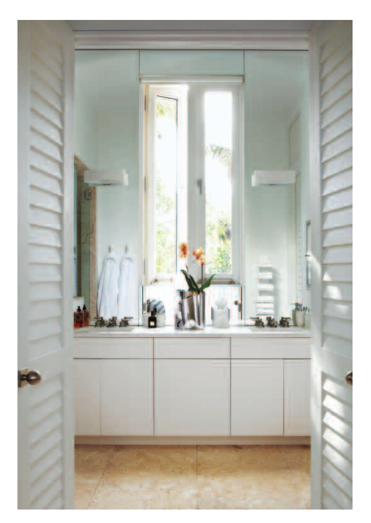
ABOVE: In the master bath, walls of mirror create an optical illusion to reflect the ocean views beyond. A spa is born with a connected outdoor shower for the ultimate in luxury.

Soft textures and vibrant colors create a backdrop for comfortable gatherings in the upstairs family room. "It's like an independent living space for our adult children," the wife says. Touches of blue bounce off the soft white walls, while a Lee Industries sofa forms a social grouping with a striped slipper chair and square cocktail ottomans upholstered in a braided Lampakanai Philippine weave by Ralph Lauren.