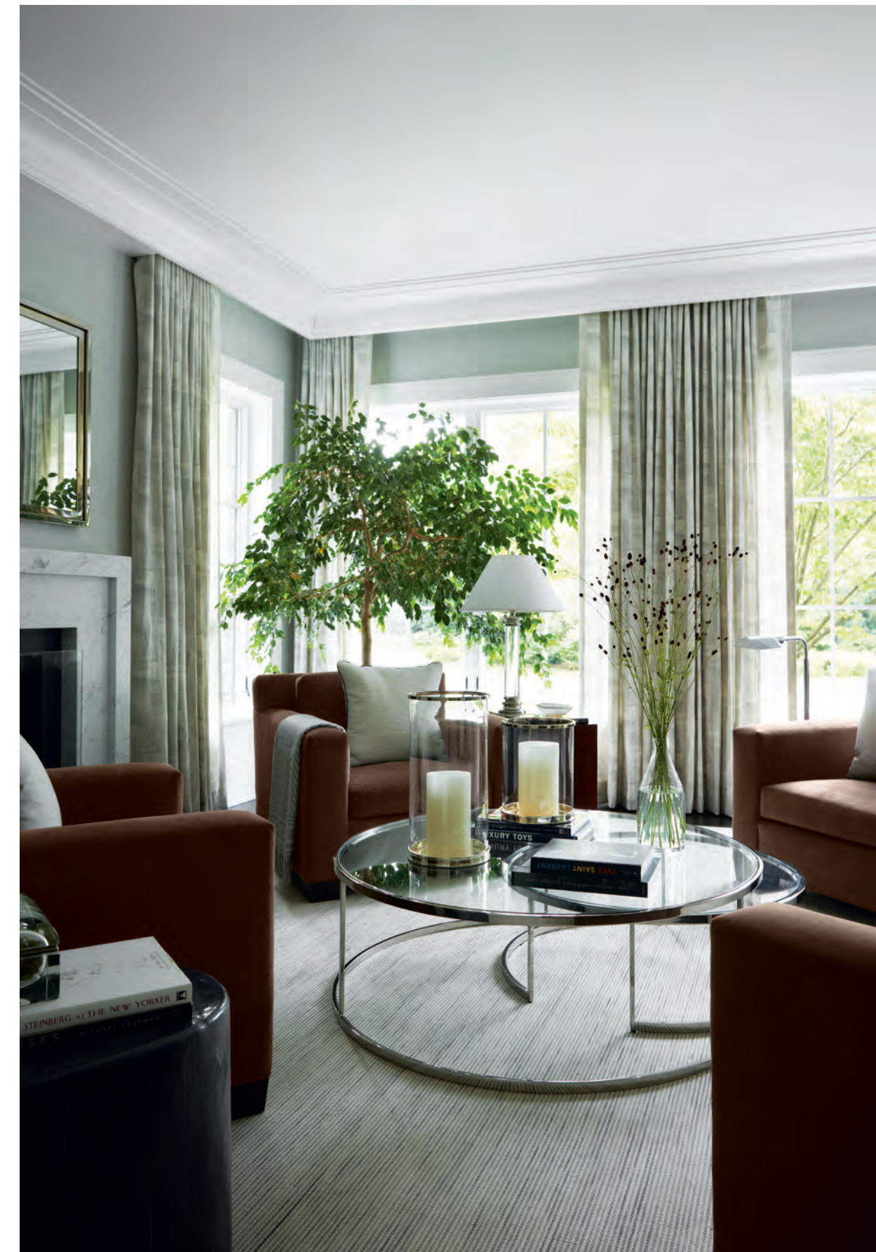
Serene Scene (OPPOSITE PAGE) The gardens were designed by Renée Byers Landscape Architect. A bench anchors the far end of the pool. The Round Table (ABOVE) Four chocolate brown armchairs, rather than an expected sofa, circle a pair of round glass cocktail tables by Desiron. See Resources .