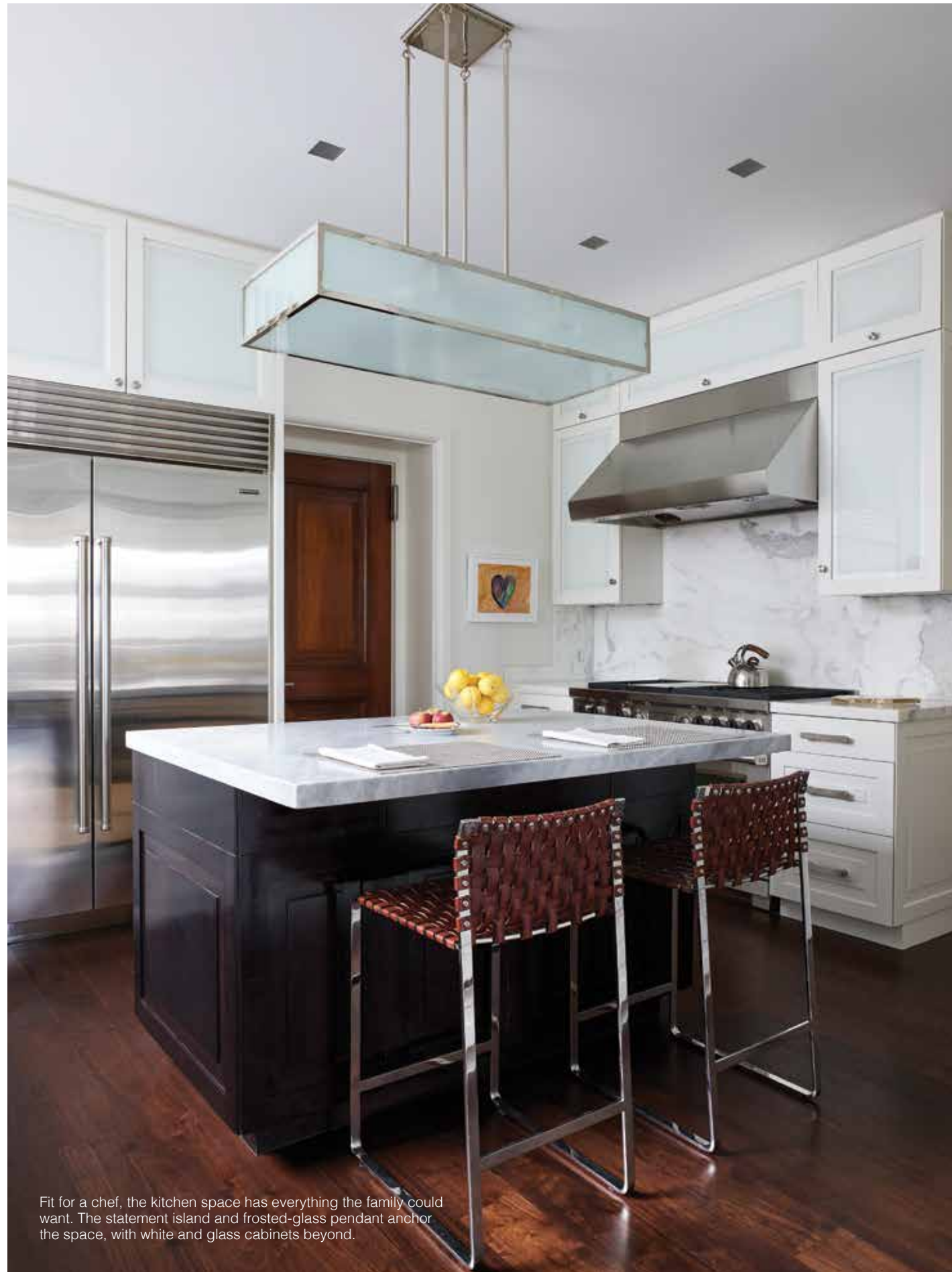
Fit for a chef, the kitchen space has everything the family could want. The statement island and frosted-glass pendant anchor the space, with white and glass cabinets beyond.