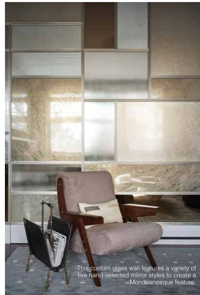
This custom glass wall features a variety of five hand-selected mirror styles to create a Mondrianesque feature.