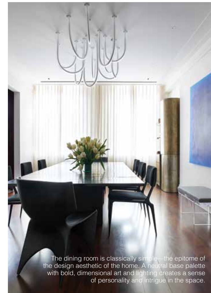
The dining room is classically simple—the epitome of the design aesthetic of the home. A neutral base palette with bold, dimensional art and lighting creates a sense of personality and intrigue in the space.

ern upgrades, the clients put their complete trust in the recommendations of the design team. As the newly acquired apartment hadn't been renovated in nearly three decades, the team was given carte blanche to reimagine it as they saw fit.