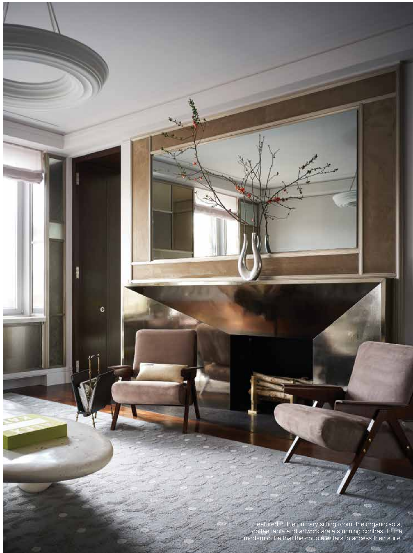
Featured in the primary sitting room, the organic sofa, coffee table and artwork are a stunning contrast to the modern cube that the couple enters to access their suite.