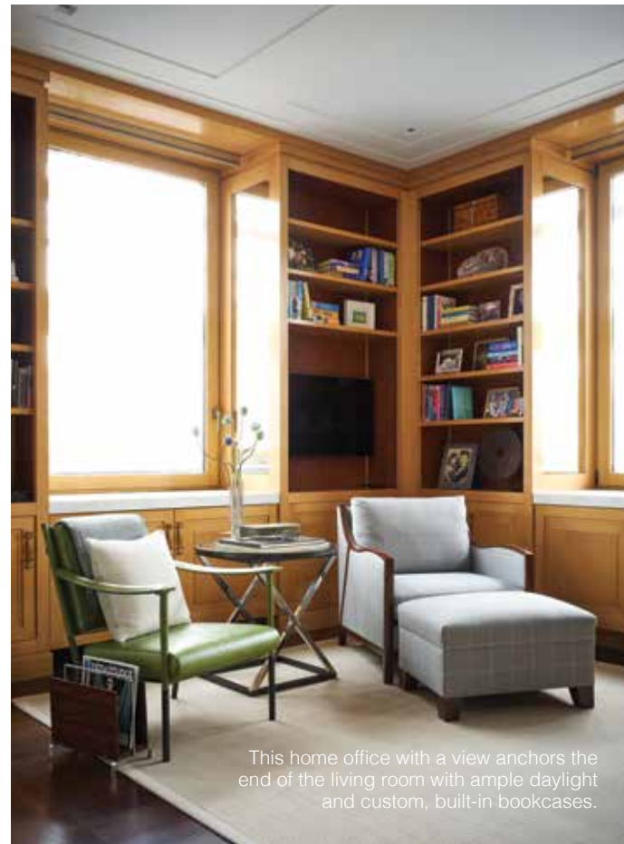
This home office with a view anchors the end of the living room with ample daylight and custom, built-in bookcases.